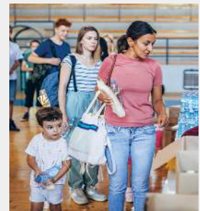
Homeowners residing in communities affected by emergencies or natural disasters