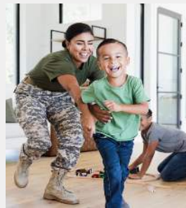
Military and veteran personnel

Contractors can provide year-long, higher-value rebates to those homeowners that serve our communities. Homeowners in the following categories can take advantage of year-long increased rebates on qualifying products: